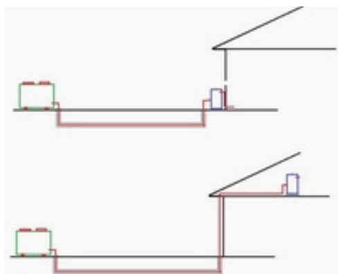
Remote heatpump location is quite acceptable if installed properly